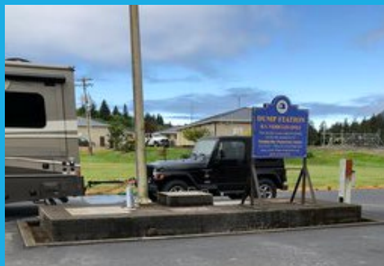
RV Dump Station NBWA Treatment Plant