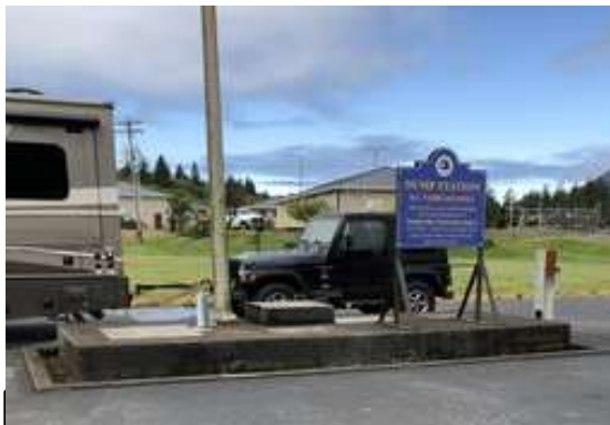
RV Dump Station located at the NBWA Treatment Plant 14000 Tideland Rd, Nehalem OR